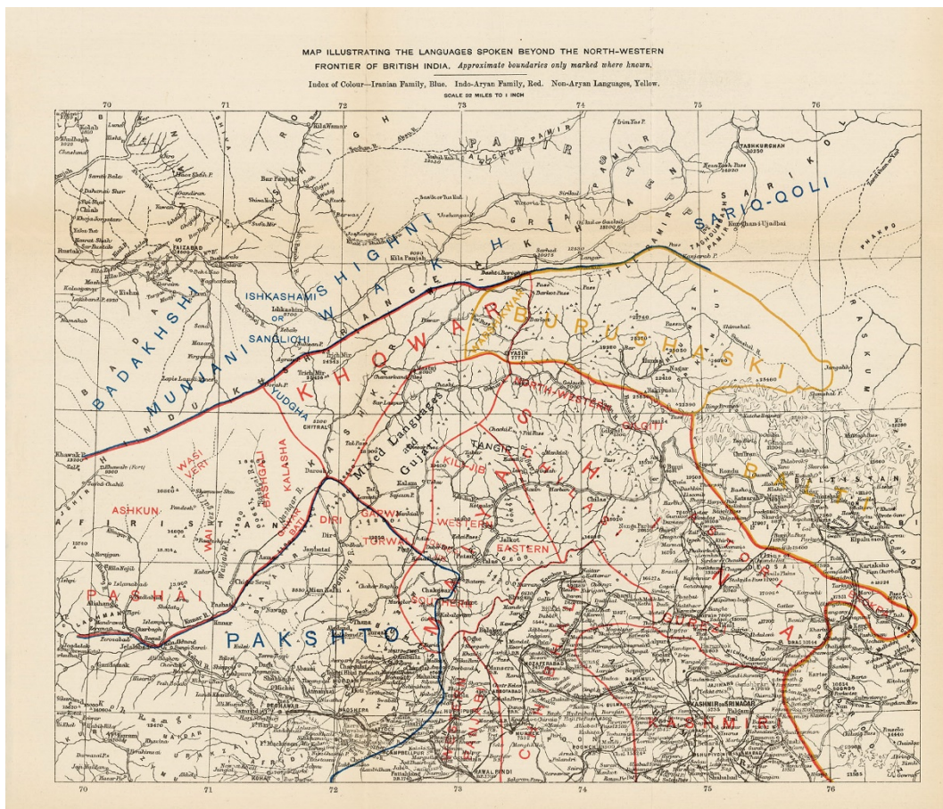
Figure 1: Map illustrating the languages spoken beyond the North-Western frontier of British India.